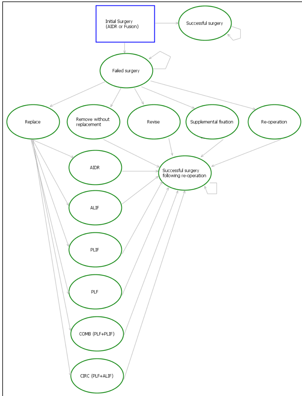
Figure 3 Structure of the economic evaluation