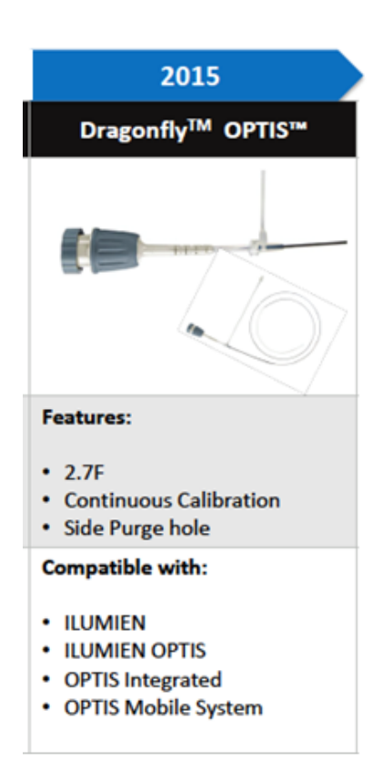
Figure 2 OCT system imaging catheter

The OCT procedure requires two operators: a sterile operator and a non-sterile operator. All steps requiring contact with the Dragonfly Imaging Catheter, or the outside of the sterile DOC cover must