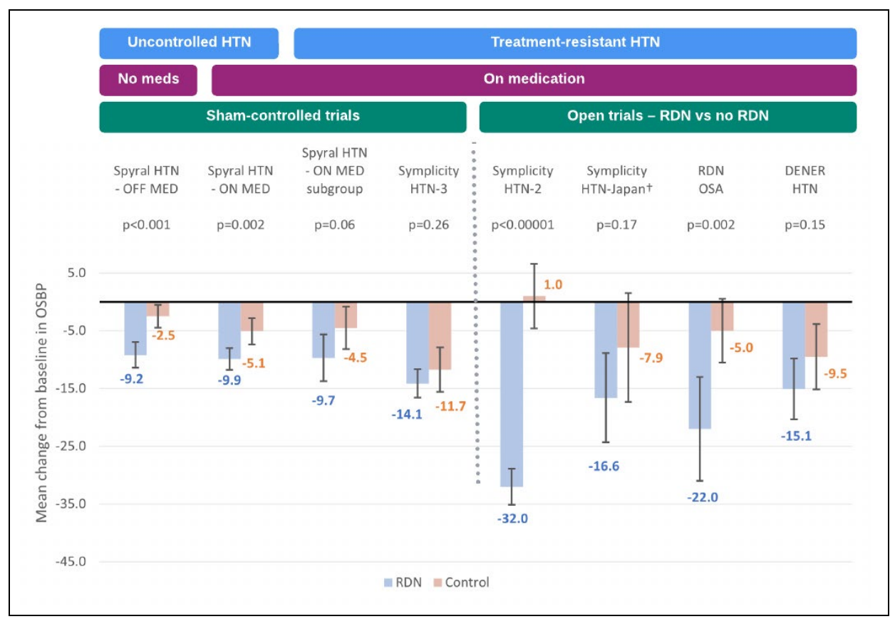
Figure 1 Mean change from baseline in mean office SBP (mmHg) for RDN and control arms of randomised trials (open and sham-controlled) reporting this outcome

HTN = hypertension; meds = antihypertensive drugs; OSBP = office systolic blood pressure; RCT = randomised controlled trial; RDN = renal denervation; SBP = systolic blood pressure