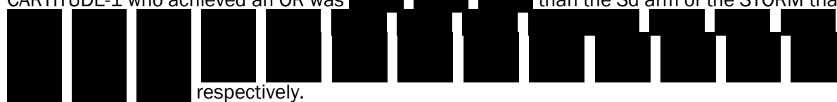
Table 9 Comparison of ORR, CRR and ≥CR rates in CARTITUDE-1 vs CE-MRDR and STORM

Cilta-cel compared favourably with available 5L+ RRMM treatments based on naïve treatment comparisons with STORM and CE-MRDR. The proportion of patients in the ITT 5L+ population of CARTITUDE-1 who achieved an OR was ██████████, ██████████, ██████████ than the Sd arm of the STORM trial