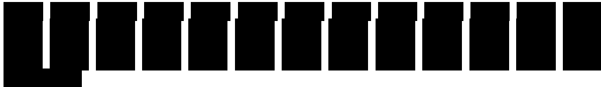
Table 14 Cilta-cel cost at each payment timepoint under risk-sharing agreement